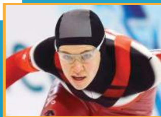
Clara Hughes 5 Time Olympic Medalist "After a week of trying out Tyent ionized water, I could not believe the difference I felt after extreme training efforts."