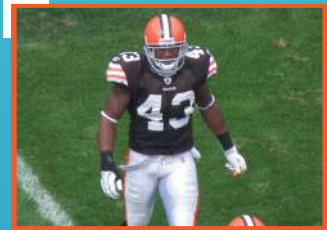
TJ Ward Professional Football Player "With Tyent Water, my recovery time is much faster and my energy levels, have noticeably increased."