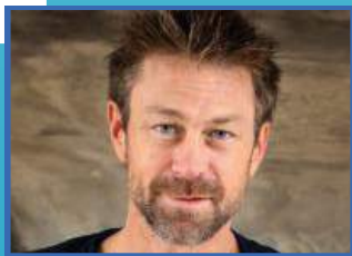
Grant Bowler Actor "Ah! This portable alkaliizer is a must-have! I could definitely use the TYgo at home."