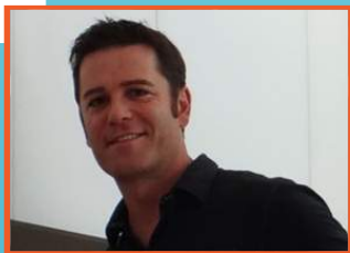
Yannick Bisson Canadian Film Actor, Murdoch Mysteries "People tell me I never age, and I tell them it's all in my Tyent Water™"

Celebrities and athletes love our brand! They demand the best and Tyent delivers.