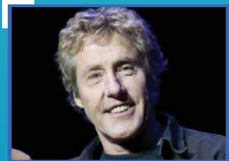
Roger Daltrey Singer "I now take a Tyent water purifier on the road with me."